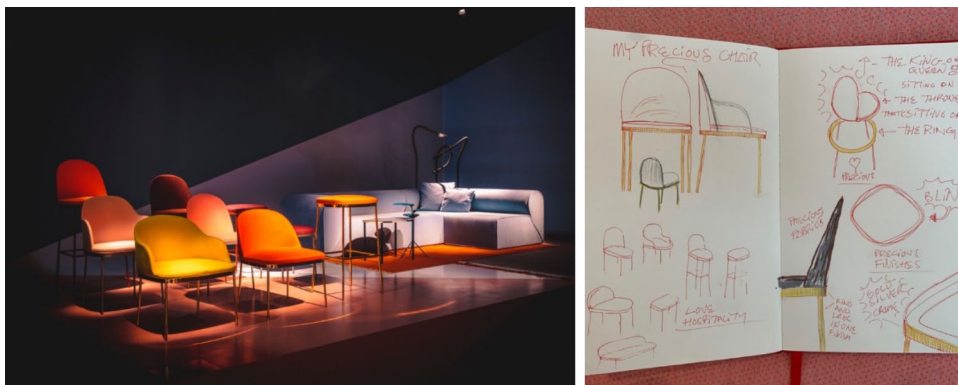
Figure 5. Product design, Moroso Precious Chair and Heartbreaker Sofa, Italy, 2019.

“A building uniquely created around the new Bang & Olufsen store design, Nexus was named after the Latin word for ‘unity’. It is the first Bang & Olufsen store to utilise the holistic nature of the company’s new retail concept; integrating architectural design, store design and products under one roof.” Excerpt and photograph from www.johannestorpe.com .