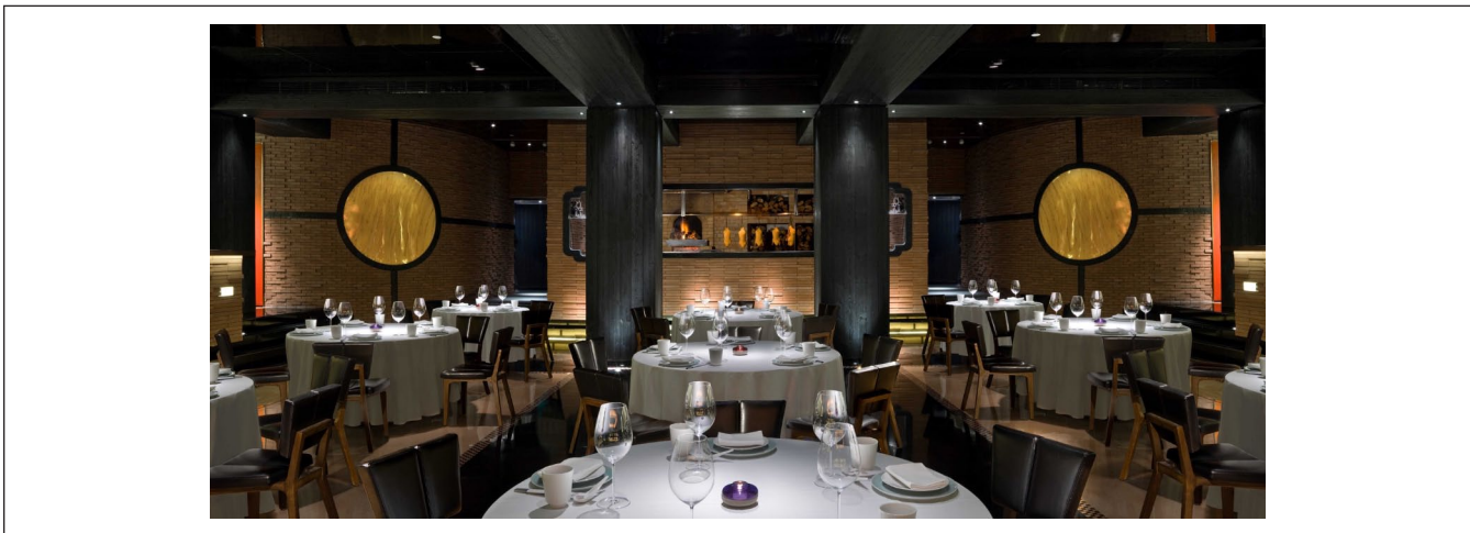
Figure 3. Interior design, Jing Yaa Tang restaurant, Beijing, China, 2013.

“Traditional components of Chinese design sparked the inspiration for the design of the fine-dining restaurant Subu. Fused together with the Scandinavian design style we created a universal aesthetic with strong references to Chinese culture and traditions like the concept of ‘private dining rooms.’” Excerpt and photograph from www.johannestorpe.com .