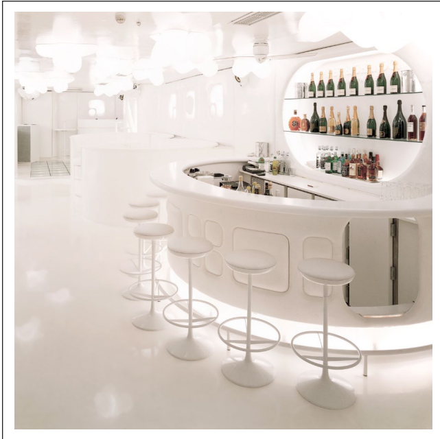
Figure 1. Interior design, NASA nightclub, Copenhagen, Denmark, 1997.

"The private members club NASA was designed as a futuristic ode to Stanley Kubrick's '2001: A Space Odyssey'. It is kept in a strictly white colour scheme, with consistently soft, organic shapes. Every detail was designed especially for this club, from the ashtrays to the doors." Excerpt and photograph from www.johannestorpe.com .