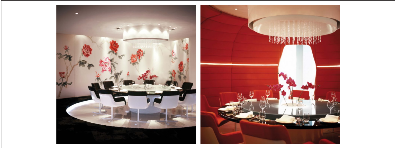
Figure 2. Interior design, Subu restaurant, Beijing, China, 2008.

“Traditional components of Chinese design sparked the inspiration for the design of the fine-dining restaurant Subu. Fused together with the Scandinavian design style we created a universal aesthetic with strong references to Chinese culture and traditions like the concept of ‘private dining rooms.’” Excerpt and photograph from www.johannestorpe.com .